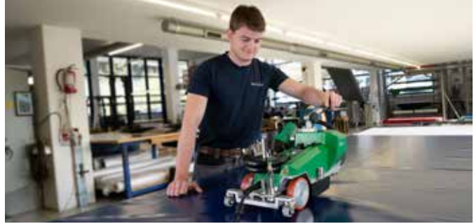
UNIPLAN 300/UNIPLAN 500: ideal for lap, hem, and piping welding either on a table or on the ground.